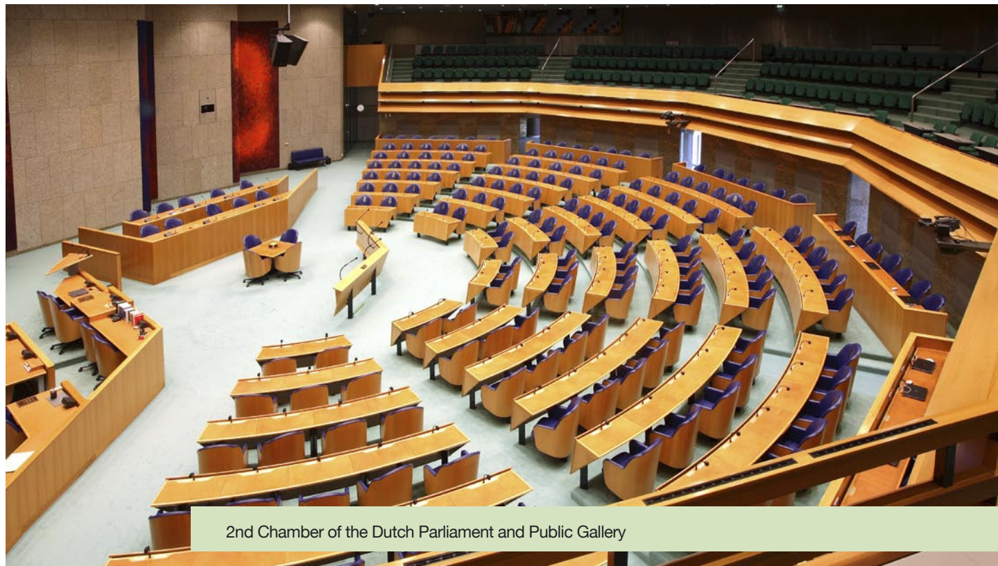
2nd Chamber of the Dutch Parliament and Public Gallery

independent foundation, the House is a merger of the Institute for Political Participation (IPP) and the Visitors' Centre of the Dutch Parliament. The House for Democracy and the Rule of Law intends to make people interested in Parliamentary Democracy in general and in the Dutch political system and its historical development in particular, in the EU and its institutions, the Rule of Law and Human Rights. The House does this by way of guided tours and visits to the Parliament, by organising debates and expositions, trainings and lectures. The main target group are pupils. Until today, the predecessor of the House – "The Hague Public Gallery" (a project of the IPP) – has yearly attracted a large amount of secondary level pupils who in the course of one day are guided through the history of Dutch Parliamentarism by help of several interactive programmes in The Hague. In the future, the House will focus on other target groups as well as, for example, newcomers' or representatives of political parties and NGO's. But also tourists will have the opportunity to visit the House and to learn more about (Dutch) Democracy.