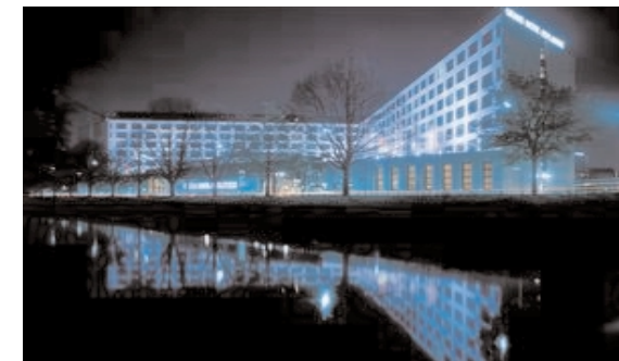
Grand Hotel Esplanade, Berlin Germany