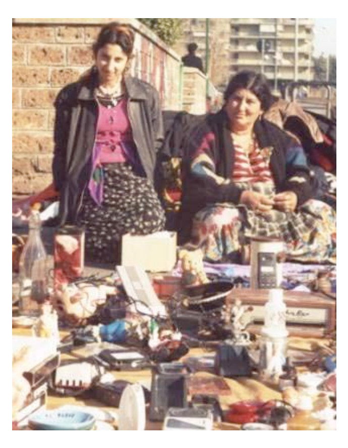
8: Xoraxanè Roma at the Roman market in via Collatina. Rome, January 2007.