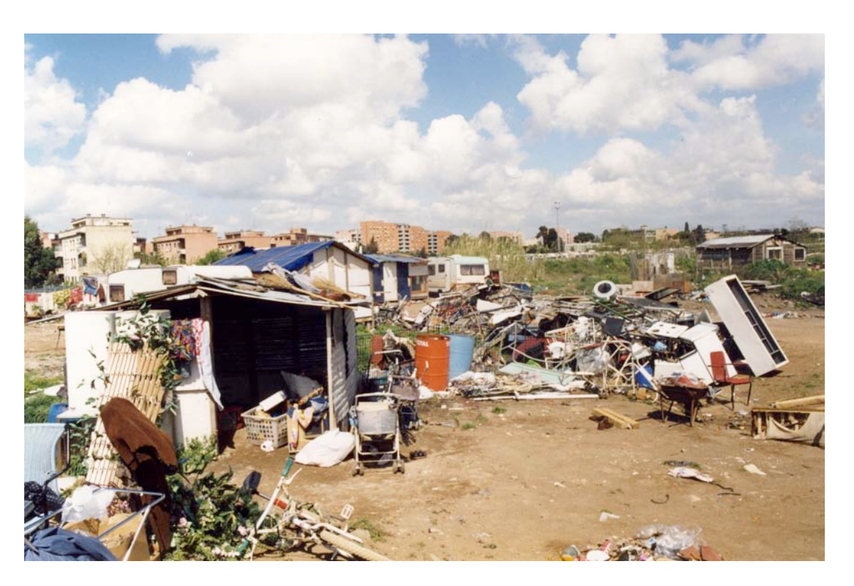
6: Materials gathered and divided at the old "Casilino 700" encampment, Rome, 2000.

During these "searches" as they are called, small groups of Romani women search the whole area's dustbins. Everything that can be fixed and resold is examined carefully and gathered: garments, shoes, small furnitures and objects (De Angelis, 2006). Everything, if saleable, is picked up.